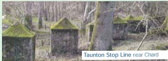
Taunton Stop Line near Chard

As well as the National Cycle Network, Sustrans is working on Safe Routes to Schools, home zones and other practical responses to the transport and environmental challenges we face. Sustrans' work relies on the generous donations and monthly standing orders of nearly 40,000 Supporters, and the support of charitable trusts, companies, the National Lottery and local authority programmes.