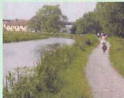
Bridgwater to Taunton Canal

Sustrans - the sustainable transport charity - works on practical projects to encourage people to walk, cycle and use public transport in order to reduce motor traffic and its adverse effects.